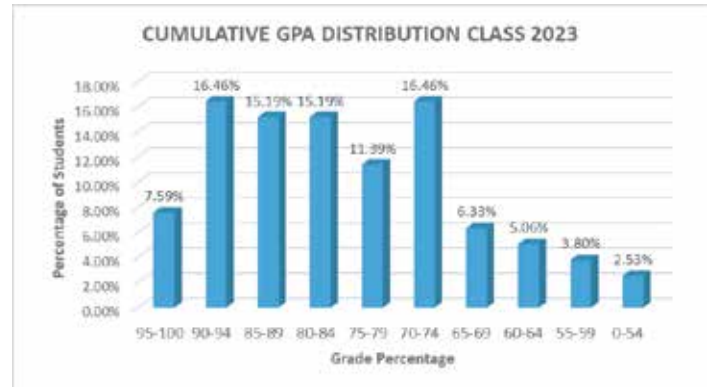
The chart below is the grade distribution for the junior year (11th grade) of our present 12th grade students.